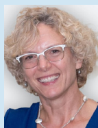
Policy Forum Chair